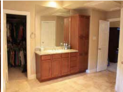
His Master Sink area