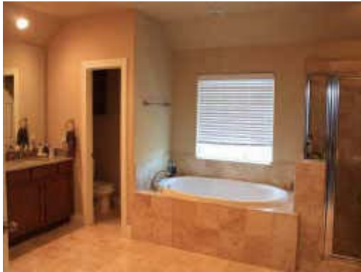
Master Bath with Whirlpool Tub