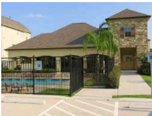
Pool & Club House