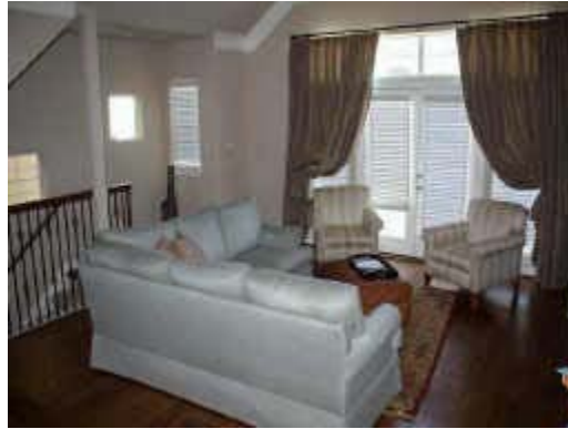
Living Room at Stairs