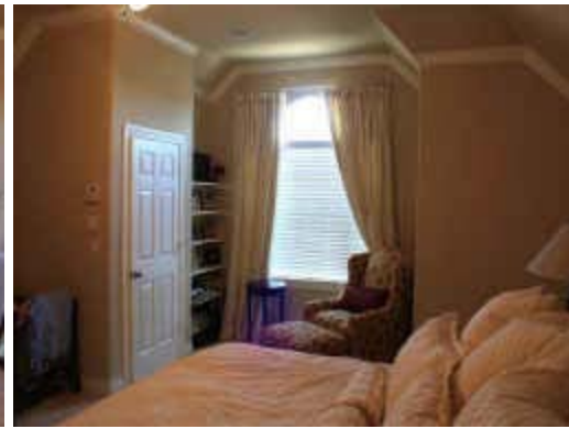
Master Bedroom Sitting Area